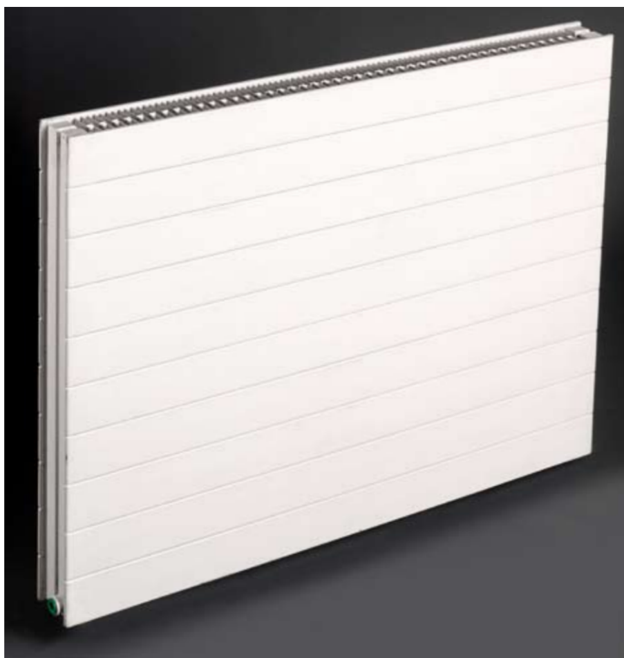
Model shown Strebel HLLH 70/70 1000 in RAL 9010