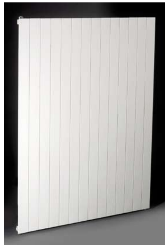
Model shown Strebel VL 140/56 980 in RAL 9010

As a standard finish in RAL9010, alternative RAL classic colour finishes are available, so whether it's a feature or functional, the DECO panel radiator becomes a great acquisition for any property.